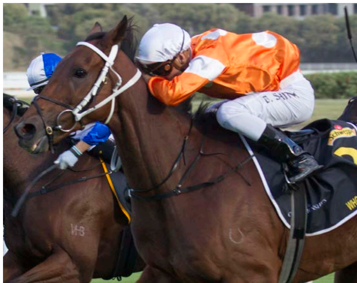
Who Shot Thebarman