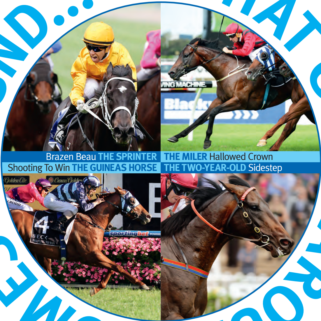
Brazen Beau THE SPRINTER THE MILER Hallowed Crown Shooting To Win THE GUINEAS HORSE THE TWO-YEAR-OLD Sidestep

Selling in 2018: the first yearlings by four brilliant new Darley stallions: beautifully bred Champions, the best of their generation. They're a must-see.