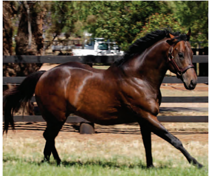
I Am Invincible

Pierata ran out a ready winner of the Winning Rupert Plate (1200m) earlier this