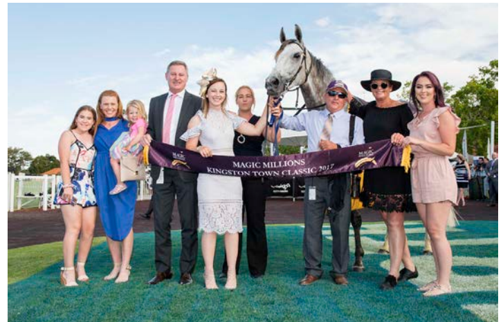
Pounamu's winning connections

"We have set him for the race having him second up in the Railway and third up in this race and it has all gone to plan."