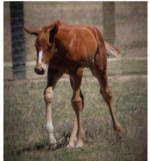
Tornado - Rainbow Queen colt