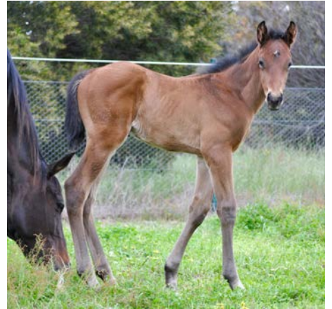
Rock Hero - Adequate colt credit: LAURISTON PARK