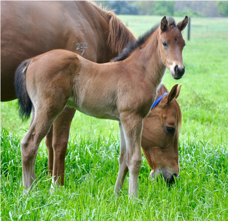
Rock Hero - Smash Hit colt