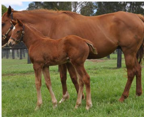
Pride Of Dubai - Vormista filly