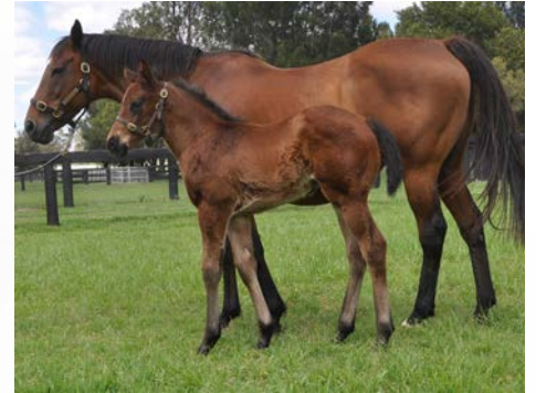
Vancouver - Secret Silence colt