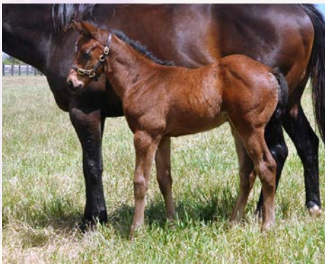
Pride Of Dubai - Little Miss Smiley filly