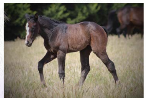
Tornado - St Trinains filly