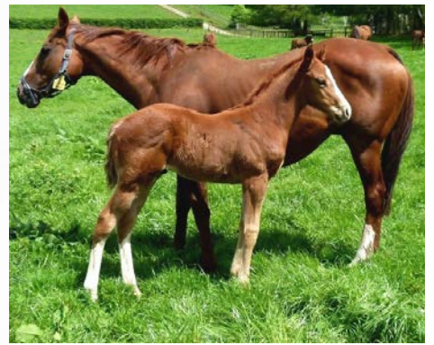
Proisir - Lionstar colt