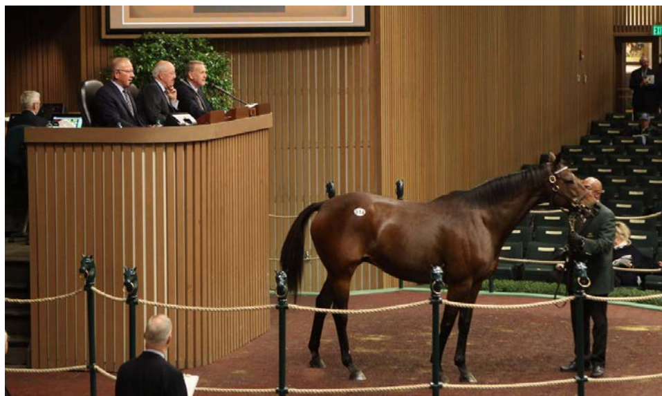
Hip 514 Fools In Love