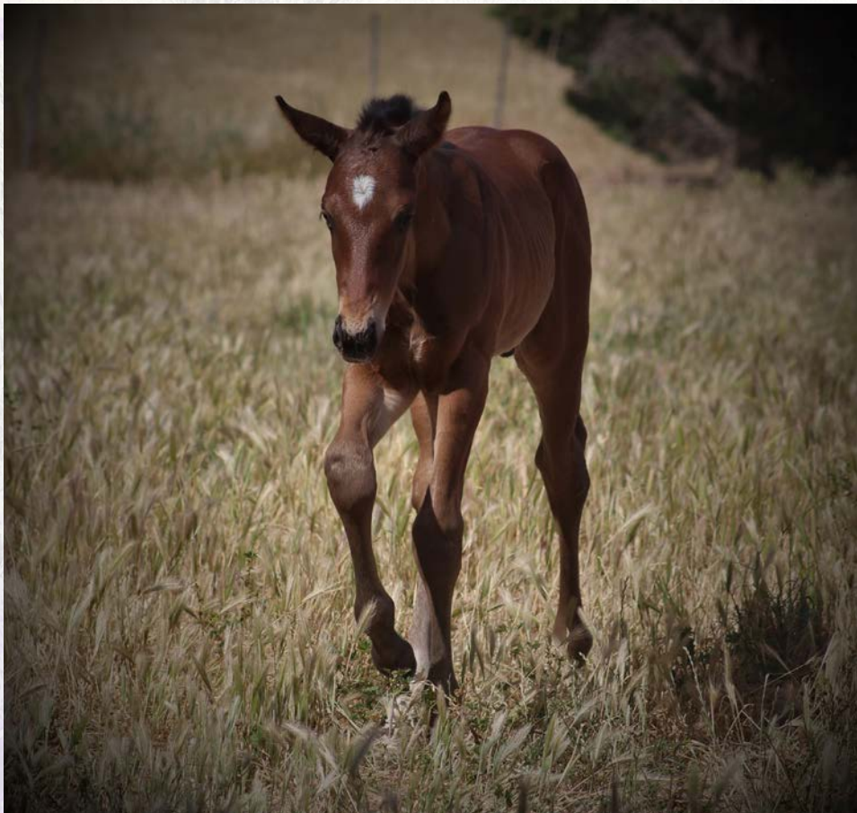
Master Of Design - Make It Shine colt