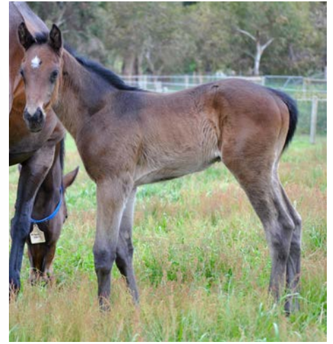
Rock Hero - Aythreethy colt credit: LAURISTON PARK