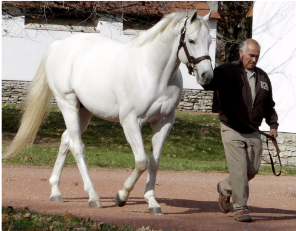
Hip 1175 Tension